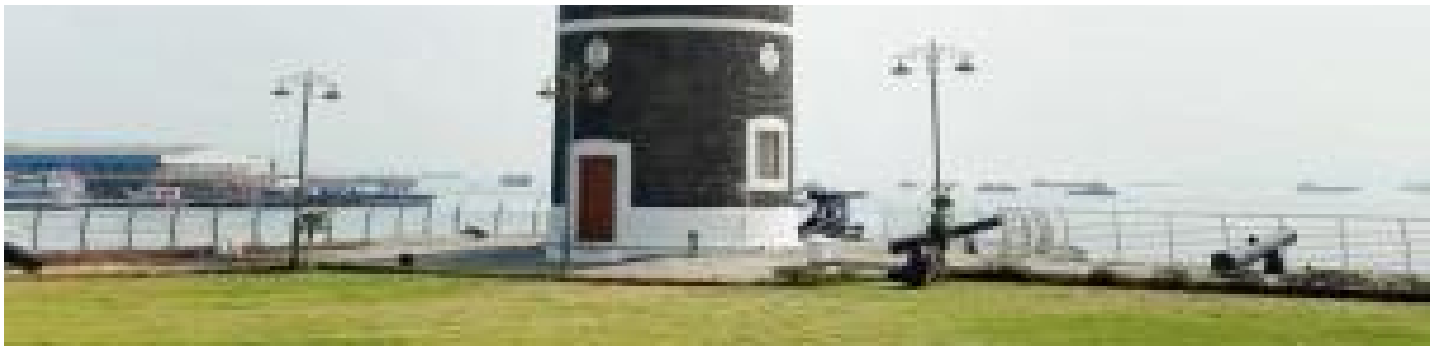
Maritime Mumbai Museum Society, Mumbai.

Even as India unlocks in various phases, a whim of a trip to a museum in the city, spending the day soaking in art, history and culture, still seems out of bounds. But city-based consultancy Art X Company's latest offering safely allows one a peek into not just Mumbai's museum circuit, but India's too — without having to move from the couch. From museums in Udaipur to Kolkata, and virtual gallery hopping in Mumbai to a musical instruments workshop organised from Bengaluru, the second edition of Ghar Se Museum, promises to be a celebration of museum culture.