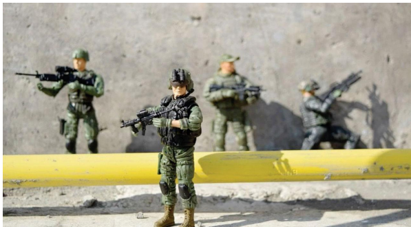
The real American hero ( https://www.mid-day.com/amp/mumbai-guide/things-to-do/article/the-real-american-hero-23159035 )