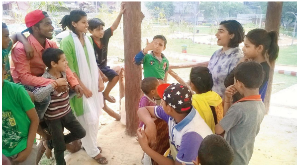
Sing your story ( https://www.mid-day.com/amp/mumbai-guide/things-to-do/article/sing-your-story-23159037 )