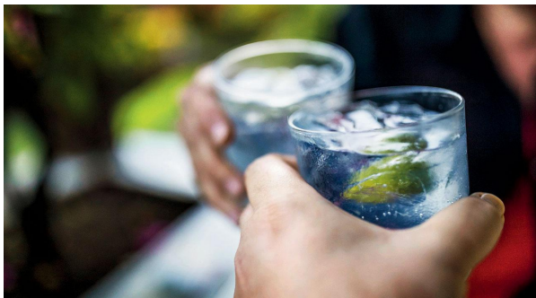
High spirits ( https://www.mid-day.com/amp/mumbai-guide/things-to-do/article/high-spirits-23158874 )