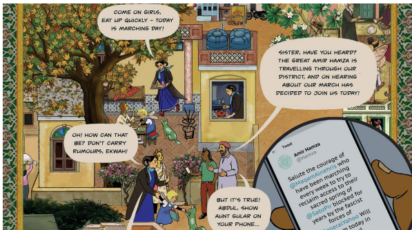
The colours of protest ( https://www.mid-day.com/amp/mumbai-guide/things-to-do/article/the-colours-of-protest-23159032 )