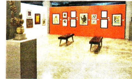
The interiors of Saffronart

lery Art & Soul, Piramal Museum of Art, Priyasri Art Gallery, Saffronart, Tao Art Gallery and Volte Gallery. The challenge though is the distance, where unlike Kala Ghoda, all galleries